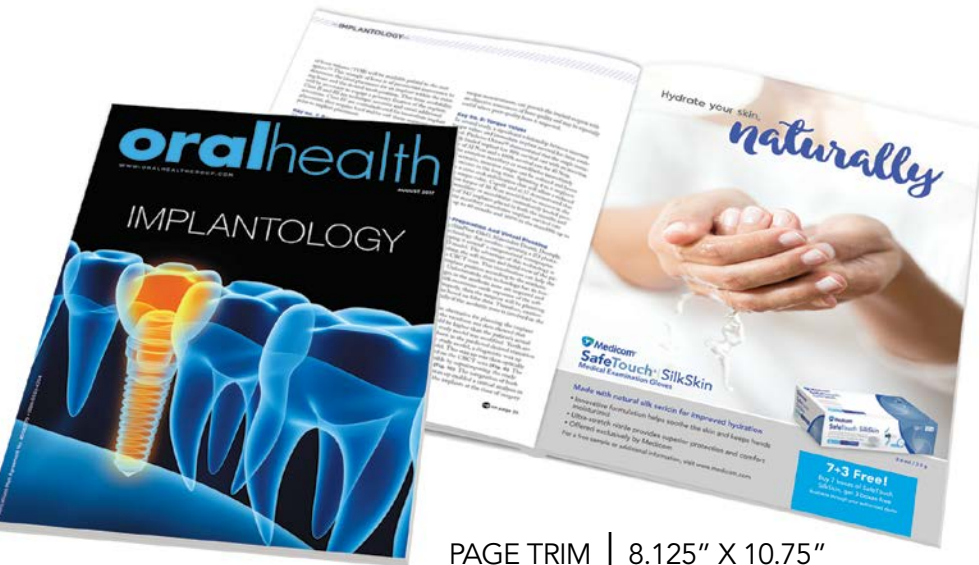
PAGE TRIM | 8.125" X 10.75"